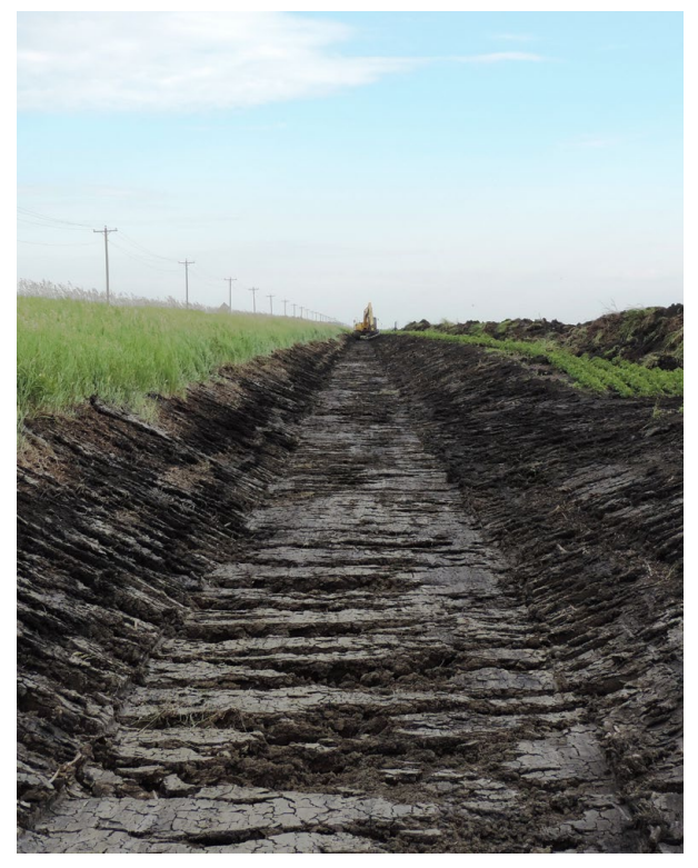
Major drain maintenance along PR 336.

Drainage of privately owned land is common, particularly in agricultural areas. Privately owned drainage projects must be registered or licensed under The Water Rights Act.