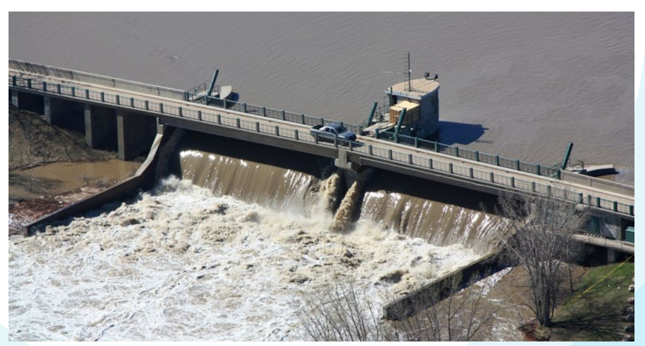
Portage Diversion during the 2011 flood event.

Located on the Assiniboine River, 24 kilometers northwest of Russell, Manitoba, is the <u>Shellmouth Dam and Reservoir</u>. The dam was designed as a multi-purpose reservoir, and began operating in 1971 to provide flood damage reduction to Winnipeg and other communities along the Assiniboine River, and to provide a more reliable water supply for downstream users. Since construction of the dam, additional operation objectives have emerged, such as flood protection of downstream agricultural lands, ecosystem health requirements and recreational interests on the reservoir. Of particular note is the substantial recreational fishery on this reservoir.