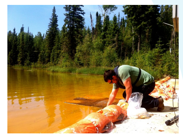
Water quality sampling of Manitoba's lakes and rivers.

Other networks provide critical information to complement the aforementioned monitoring networks. For example, Manitoba maintains several weather networks, monitors soil moisture and collects information on fish and other aquatic species. Programs such as the Coordinated Aquatic Monitoring Program (CAMP), a partnership between Manitoba Hydro and the Manitoba government, monitor and track measures of ecosystem health in a coordinated manner.