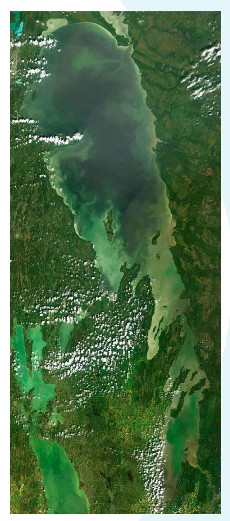
Satellite image of algal blooms on Lake Winnipeg at the end of July, 2012.

Manitoba also works with Canada and other partners to measure and report on physical, chemical and biological conditions in Lake Winnipeg. In April 2020, the Manitoba government and the Government of Canada released the second edition of the State of Lake Winnipeg report. The report serves as a reference to measure progress towards reducing nutrient loading, assess the overall health of the lake, and provide key information to support current and future research on Lake Winnipeg. Approximately 70 per cent of the water and 50 per cent of the nutrients in Lake Winnipeg originate from outside Manitoba. Manitoba continues to work closely with our neighboring jurisdictions to improve water quality and reduce nutrients. The State of Lake Winnipeg.