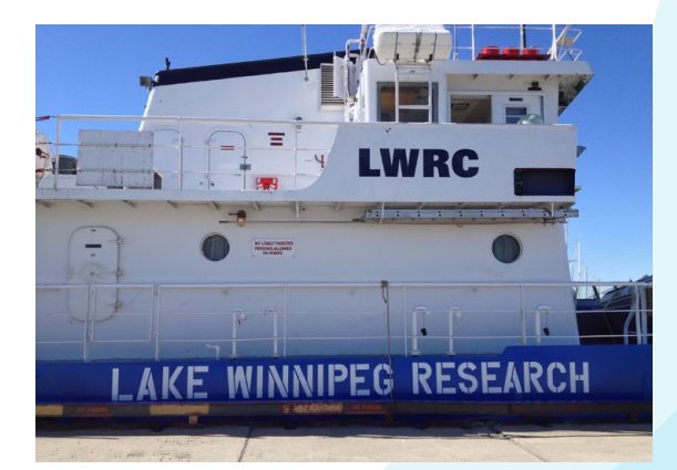
Lake Winnipeg Research Consortium's research vessel the MV Namao.