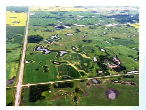
Prairie pothole landscape north of Brandon, Manitoba.

You can learn more about Manitoba's major water infrastructure in Appendix A and hydroelectric development in Appendix B.