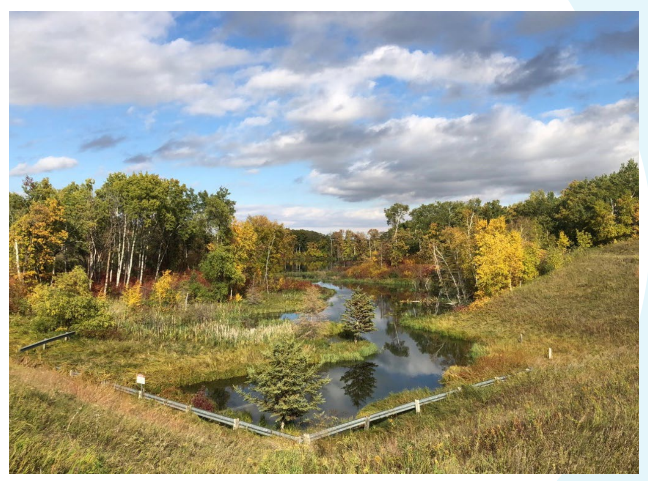
The spillway at Jackson Lake.

The Lower Assiniboine River Pump Sites transfer water from the Assiniboine River into the Mill Creek, La Salle River and Elm River systems. These three pump sites were constructed in 1984 to provide a dependable water supply for municipal, domestic, irrigation and stockwatering purposes for the La Salle River Watershed.