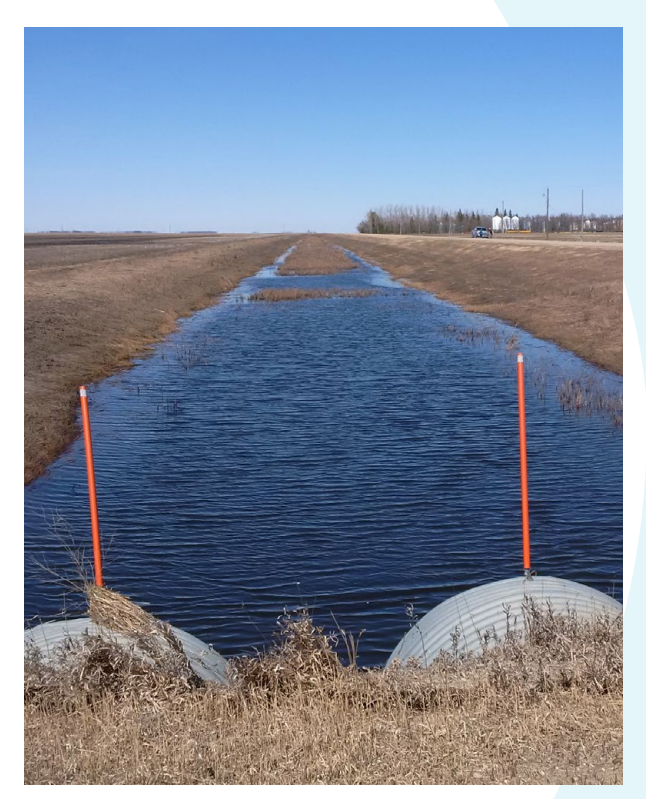
A drainage network in south central Manitoba.