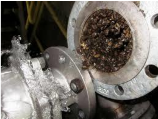
A three-foot-diameter pipe clogged by zebra mussels in less than three months

Zebra mussels can clog surface water intake pipes of public or semi-public water systems, or even intake pipes in an infested river or lake serving private homes or cottages. This can cause a loss in pumping ability or obstructed valves, sometimes leading to plant shutdowns. Zebra mussels can also increase corrosion of cast iron pipes and are a safety hazard when hydrant systems are clogged and fail to deliver fire-fighting water.