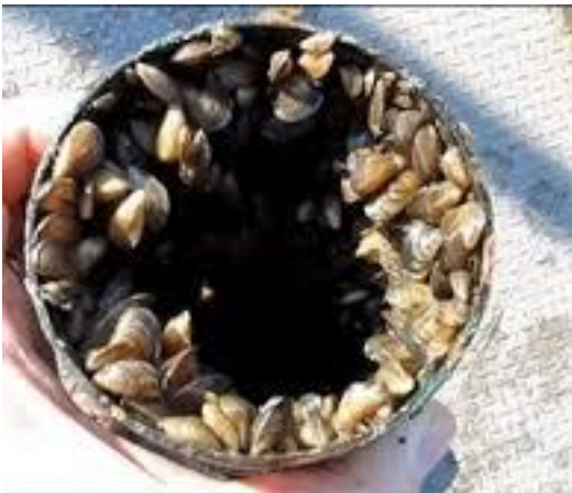
Water intake pipe in Ohio