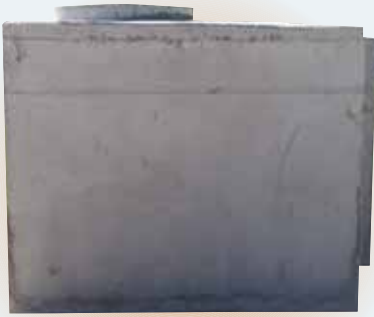
Figure 1. CSA Approved Concrete Holding Tank