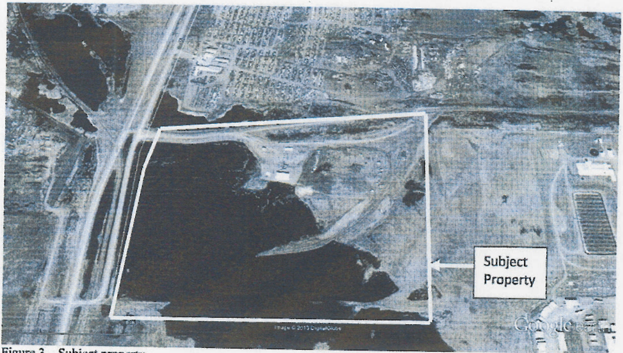
Figure 3 - Subject property