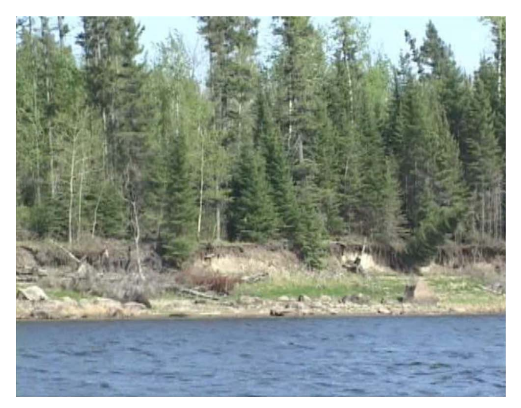
Photo 7.19: Potential Mobilization of Woody Material initially deposited above the Water line