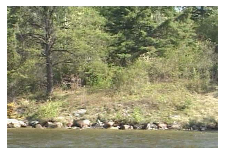
Photo 7.13: Clay Shoreline with Underlying Till Material along the Winnipeg River

Till Silt/Sand layers of various thicknesses underlie the clay soils in some locations along the Winnipeg River (Photo 7.13) representing in total 6% to 14% of the shoreline length along the two reaches of the river. Erosion of these shorelines progresses towards a selfarmoured mature condition. The finer till material is eroded and deposited in the lateral zone below the water-shoreline interface. Remnants of the wave-sorted tills result in cobbles and boulder s at the existing shoreline, providing armouring against further wave action and resulting in a low risk of erosion of the overlying clay soils.