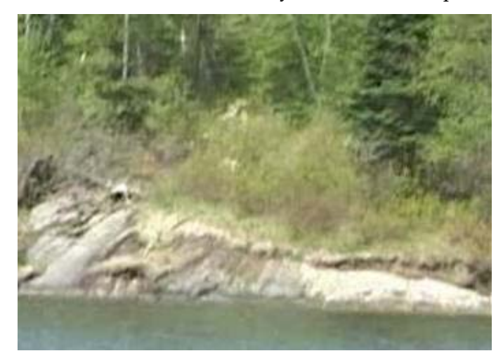
Photo 7.11: Example of Bedrock Shoreline with Overlying Till along the Winnipeg River

longer being subjected to wave energy. Often along the Winnipeg River a lower section of the till has been historically eroded to the exposed bedrock.