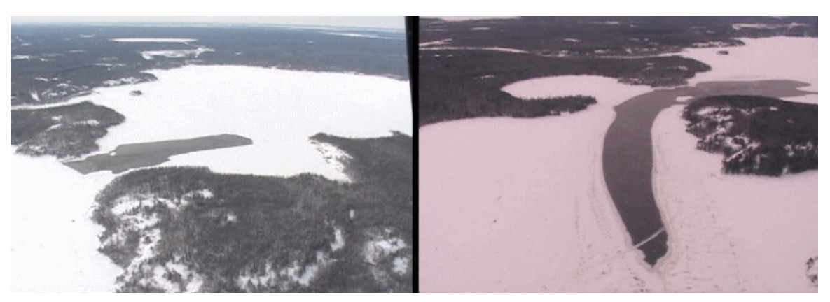
Date taken: 02-22-20 Photo 7.8: Sturgeon Falls looking West