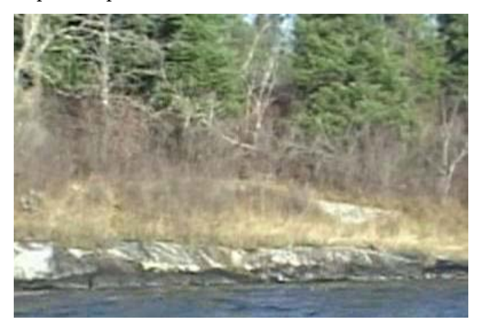
Photo 7.10: Example of Bedrock Shoreline with Overlying Clay along the Winnipeg River

Bedrock shorelines with overlying glaciolacustrine clay overburden (Photo 7.10) where the clay/rock interface is 0.50 m or more above the average water level have no risk of erosion from wave action, as the clay is not being subjected to wave energy. The clay overburden consists of a range of thicknesses and slopes from thin clay veneer to deposits up to 3 m of thickness.