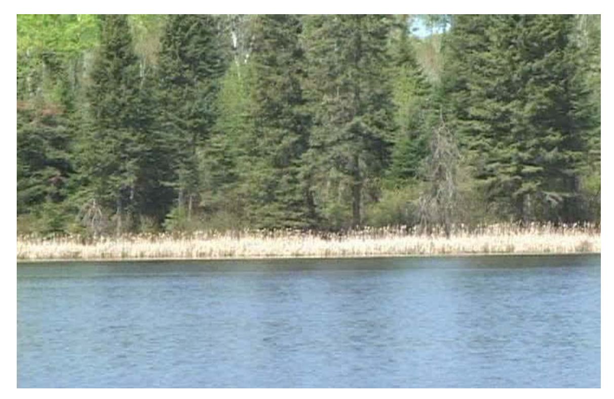
Photo 7.16: Organic Shoreline in Marsh Areas along the Winnipeg River