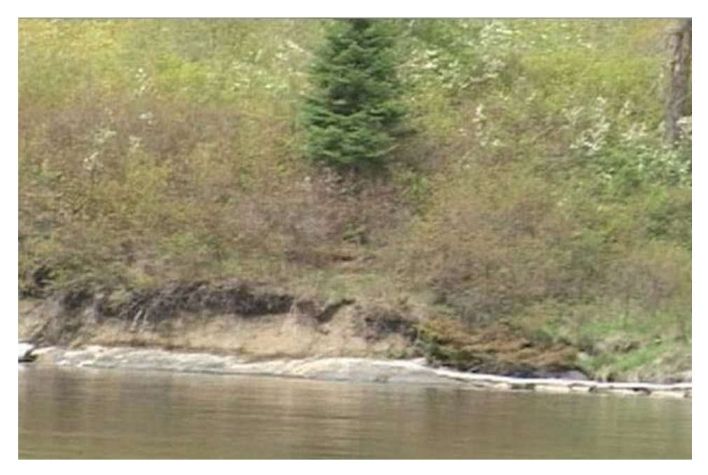
Photo 7.14: Clay Shoreline with Underlying Bedrock along the Winnipeg River