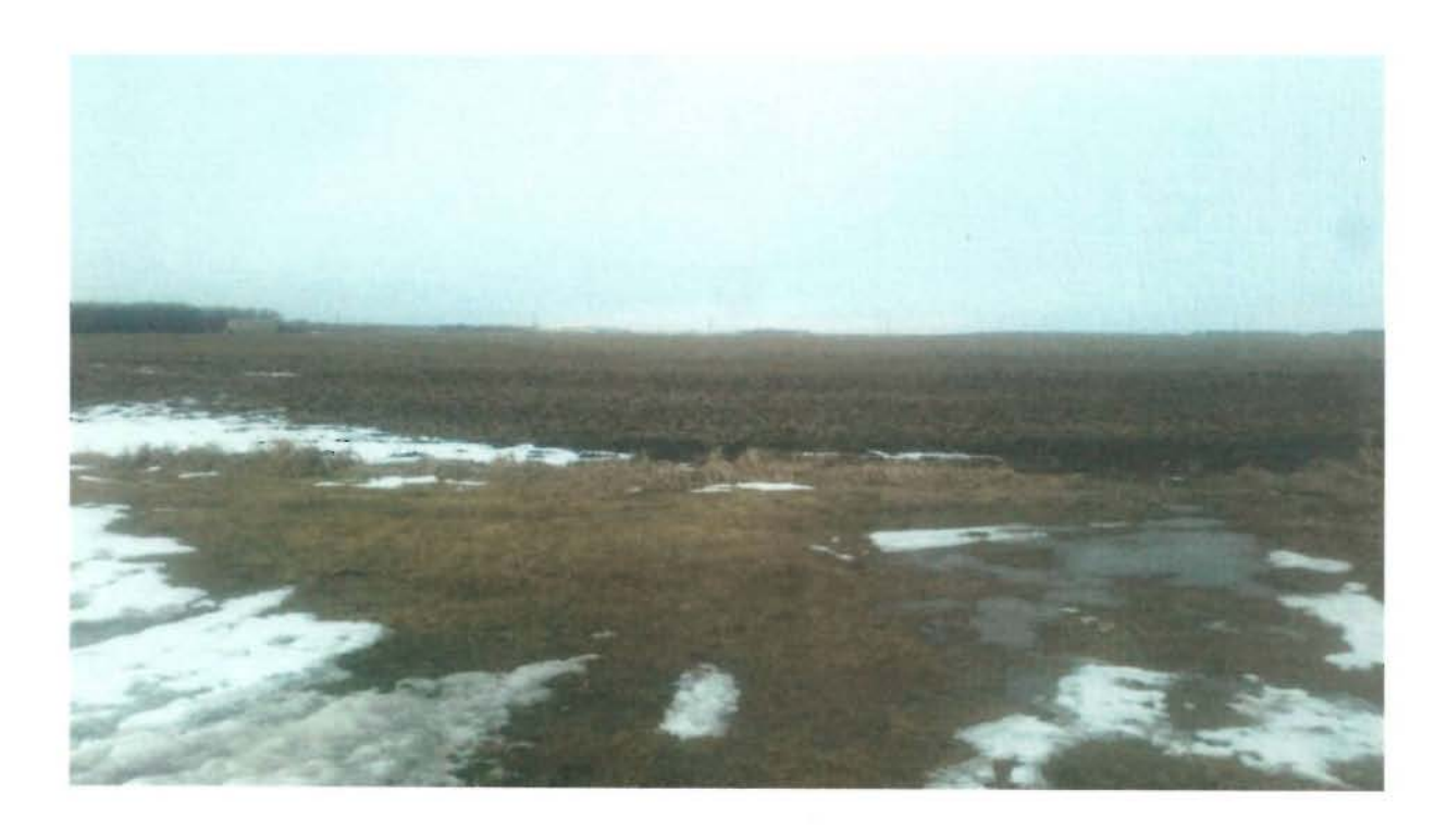
Figure 1-2 Development Area and Existing Agricultural Use

April 27, 2016 Tracey Braun, M.Sc. Manitoba Conservation and Water Stewardship - 4 -