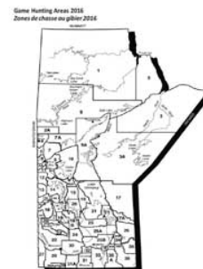
Game Hunting Areas Map page 12