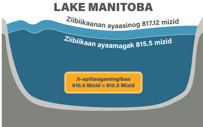
Figure 2: Epiitaagamingin Lake Manitoba