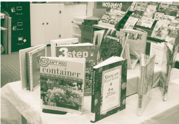
A display of gardening resource books at the fourth annual Veggie Adventures Curriculum workshop in Leaf Rapids.