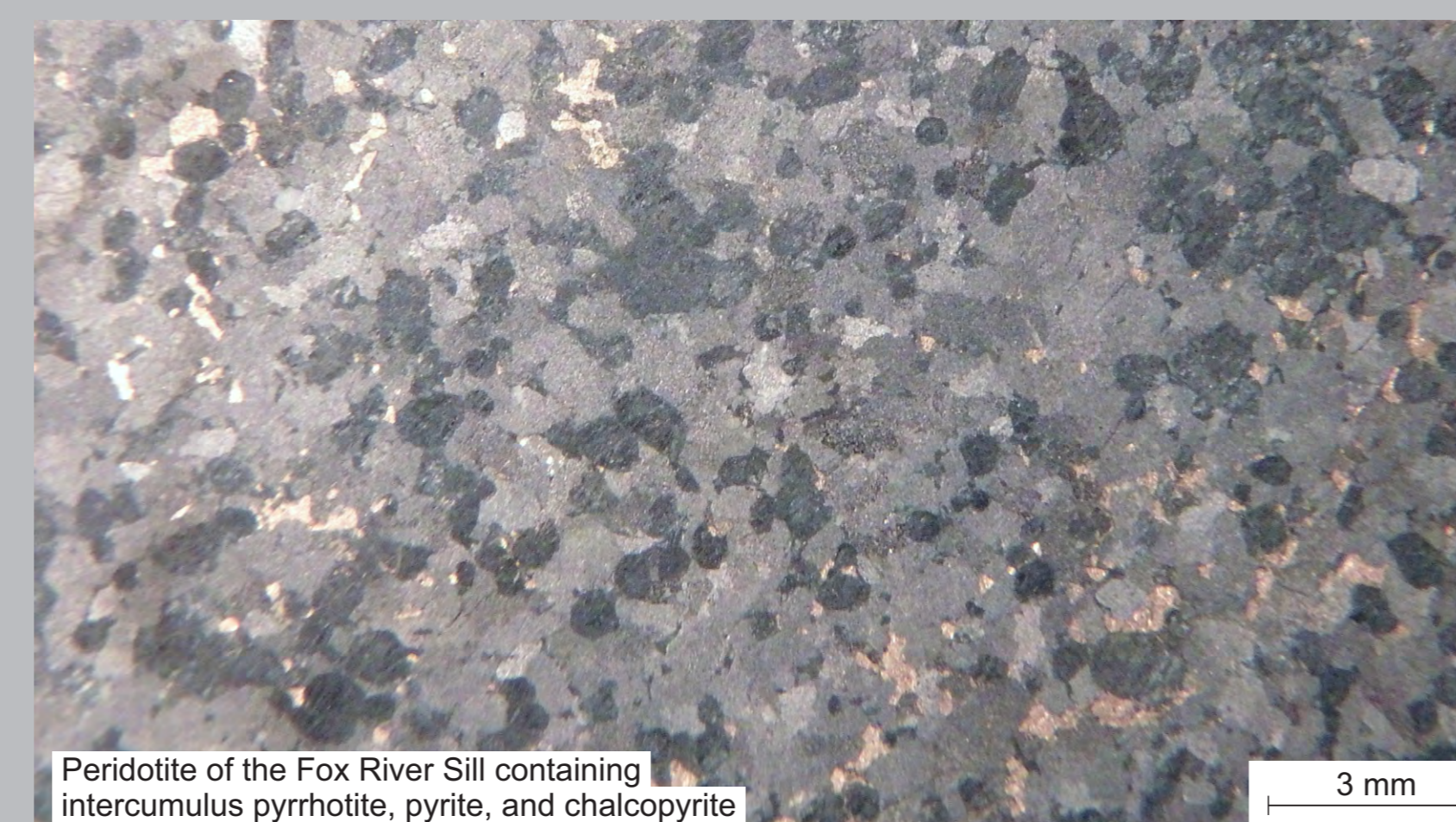
Peridotite of the Fox River Sill containing intercumulus pyrrhotite, pyrite, and chalcocopyrite