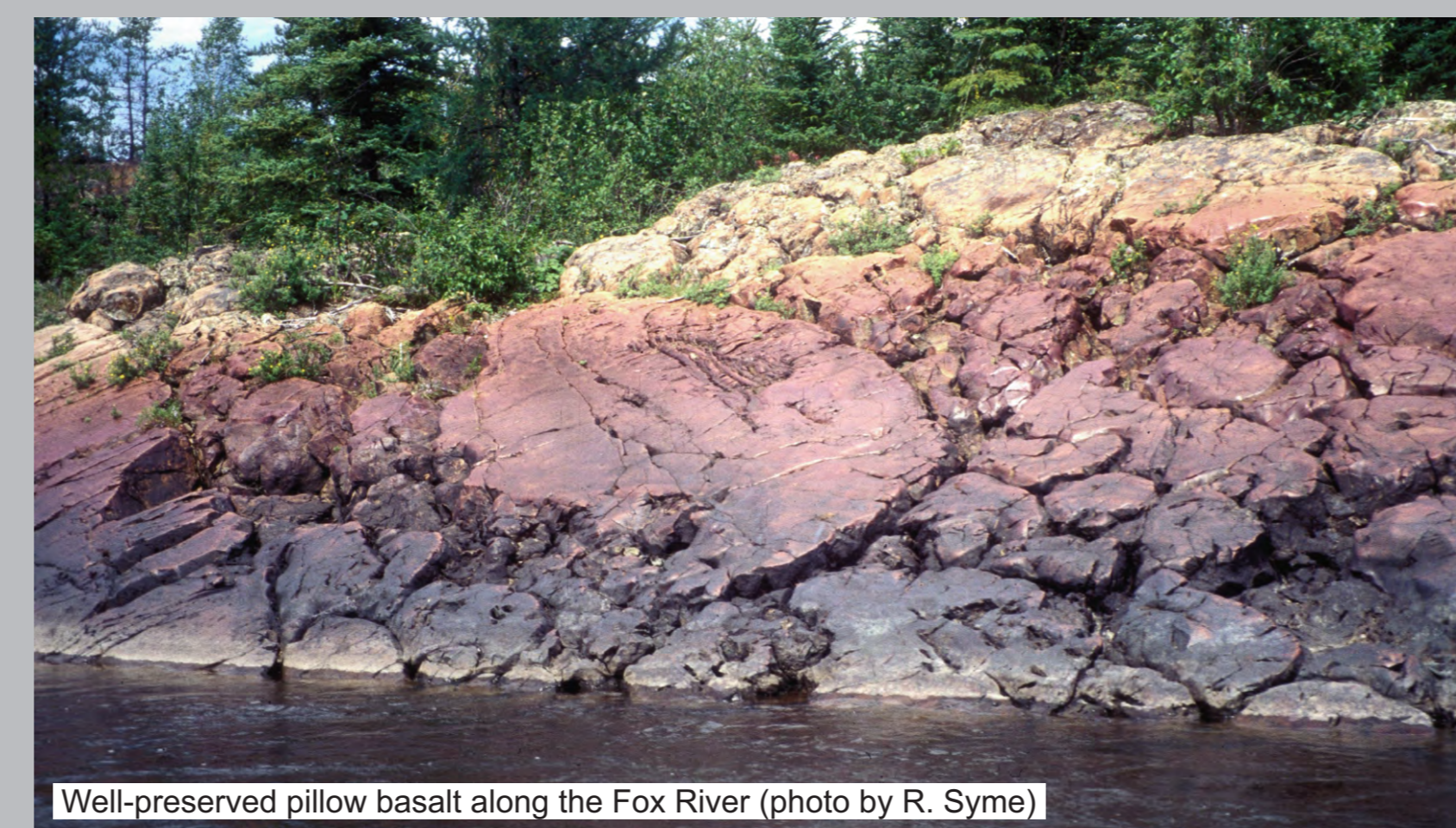
Well-preserved pillow basalt along the Fox River