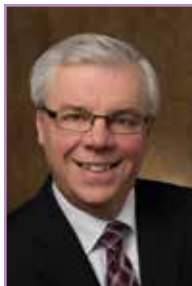
Greg Selinger Premier of Manitoba