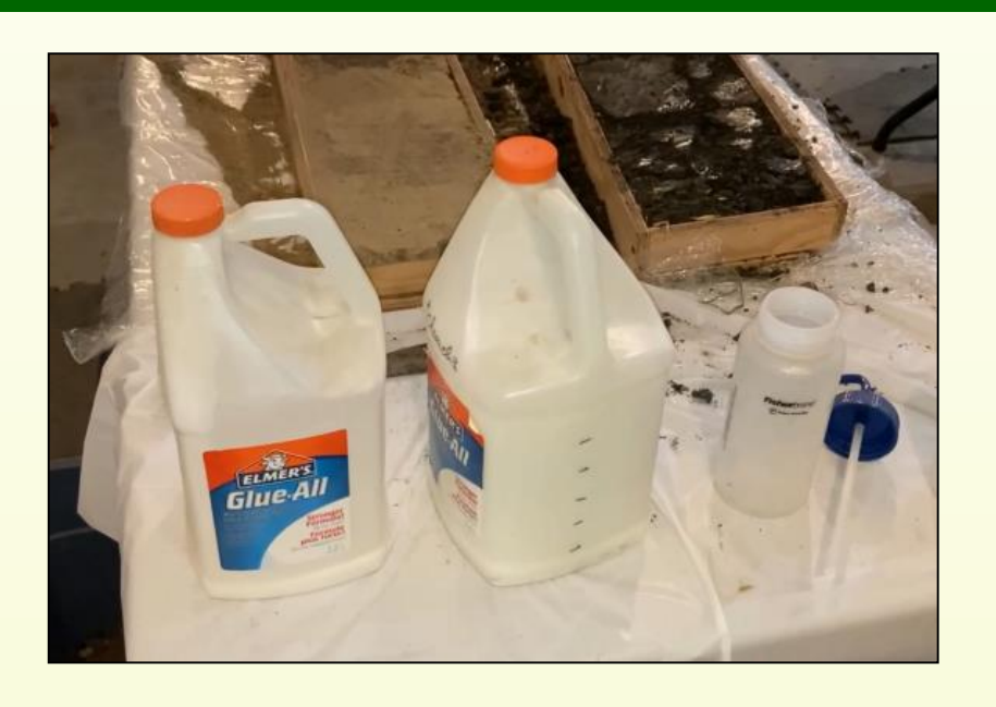
Steps 3 - 4: First and second soakings with glue:water mixtures