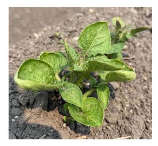
Fig.5. Cupping of young leaves – apparent injury from herbicide, with no distribution pattern in field - probably seed borne.