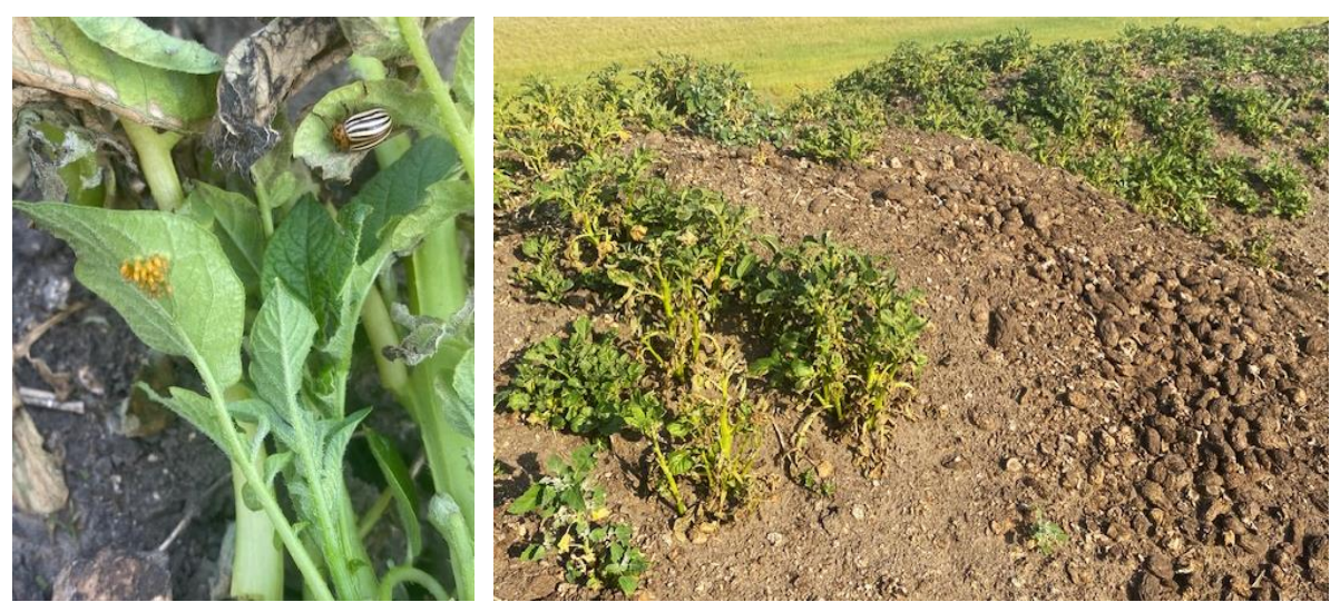
Fig.7. Colorado potato beetles – adults and egg masses were found on the cull piles.

Growers and industry stakeholders, please report or submit for diagnosis, any disease or insect observations of importance. If you suspect late blight in your area, please contact <a href="wikingsolvenbedgev.mb.ca">wikingsolvenbedgev.mb.ca</a>