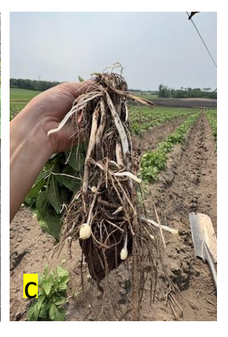
Fig.4. Tuberization has started in many fields. a: May 9 planted, Shilo. b: May 1 planted, Shilo. c: May 2 planted, MacGregpr.