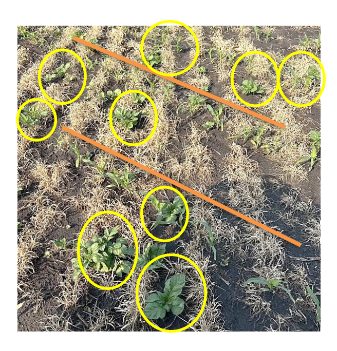
Fig.6. A field with corn following potatoes had a lot of volunteer potatoes growing (in yellow circles). Glyphosate on RR-corn used for killing the cover-crop left the potato volunteers untouched. Corn rows are marked with orange lines.