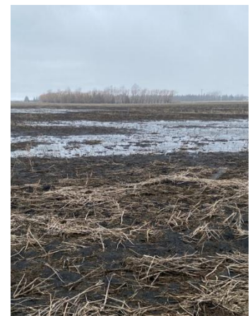
Figure 2. Near Teulon

Despite temperatures reaching the high twenties last week, cold weather in April and early May has led to slow snowmelt, retaining moisture in fields and creating standing water in drains. Evidence of snowbanks remains on the north side of the tree lines. Overnight lows remain below freezing, with average temperatures between 6 and 8.5°C and only a few light showers reported.