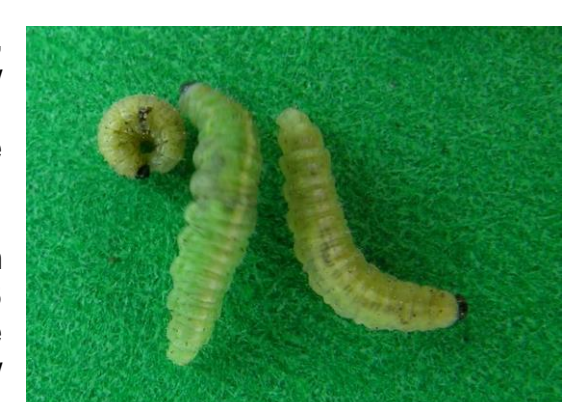
Figure 1. Alfalfa weevil larvae

Alfalfa weevil can be an important early-season defoliator of alfalfa, but will also feed on other forage legumes. One of the heavy populations reported this week was from a sweet clover field. Larvae go through four growth stages (or instars). The larvae are not too big and can blend in with the vegetation well, which can make them hard to notice until damage starts getting quite visible. First instars will be just 1 to 2 mm long and light-yellow to tan with a darker head. Fully grown larvae (fourth instars) are about 6 to 8 mm long and bright green with a white stripe down the centre of the back, and a black head capsule. Early harvest of hay fields, by cutting in early bloom, can manage high densities of alfalfa weevil larvae. Larvae are killed by desiccation or starvation.