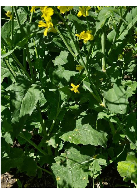
Figure 2. Fallen petals, sepals and anthers provide the sugars for SSR infection

"... in later seeded canola ... wilting plants and ample evidence of root rot was found in these fields. Dry conditions are needed to prevent root diseases from taking hold in large areas of fields." - Eastern Region.