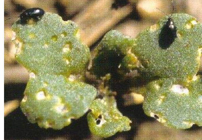
Figure 1. Flea beetles and feeding pits

The economic impact of flea beetles on crop production varies with population densities of flea beetles, and growing conditions for