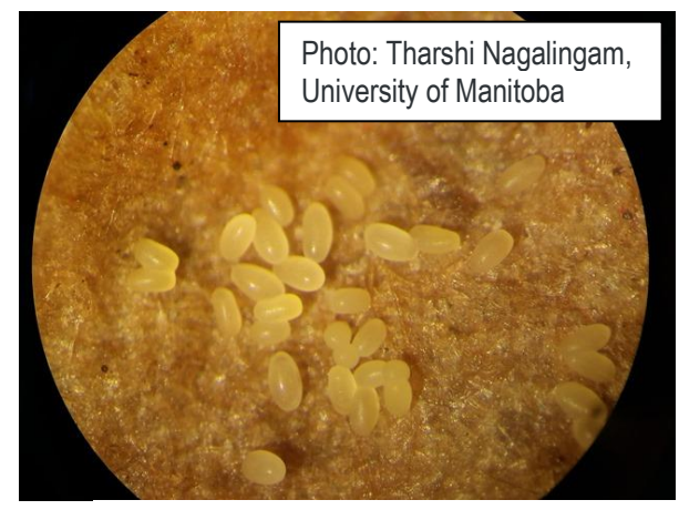
Figure 5. Eggs of striped flea beetle.

Eggs: Females deposit about 100 smooth, yellow, elongate, oval eggs (0.38 to 0.46 mm by 0.18 to 0.25 mm wide) either singly or in groups of three or four in the soil adjacent to the