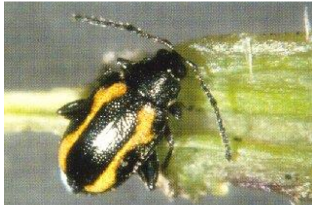
Figure 3. Crucifer flea beetle