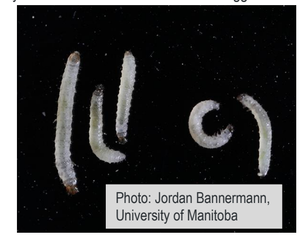
Figure 6. Larvae of striped flea beetle.

Pupae: Flea beetle pupae are usually present in the field by early to mid-July. They are entirely white except for the eyes which darken as the pupal stage progresses to completion. The body