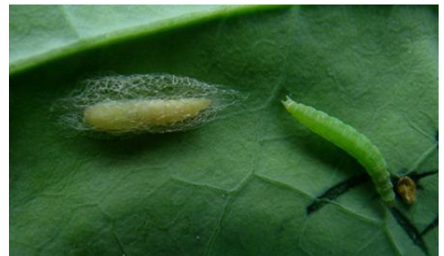
Figure 4. Diamondback moth pupa (left) and larva (right).

Guidelines for monitoring larvae of diamondback moth can be found at: https://www.gov.mb.ca/agriculture/crops/insects/pubs/diamondback-moth-factsheet.pdf