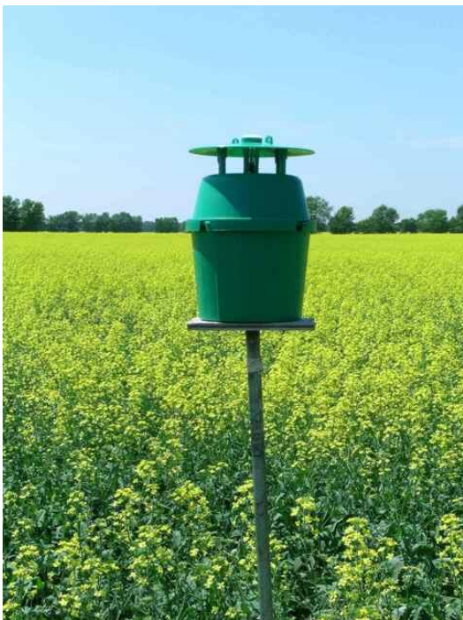
Figure 1. Trap for monitoring bertha armyworm

The cumulative moth counts from the traps, which are presented in the table below, can not predict what the level of larvae will be in the field a trap is in, but can be used, in conjunction with counts from other traps in a region, to determine areas of the province at higher risk and where increased monitoring of fields for larvae may be necessary.