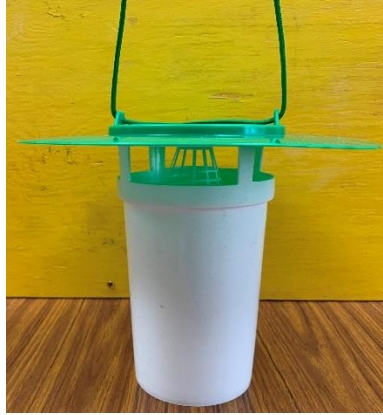
Figure 3. Multipher trap assembled