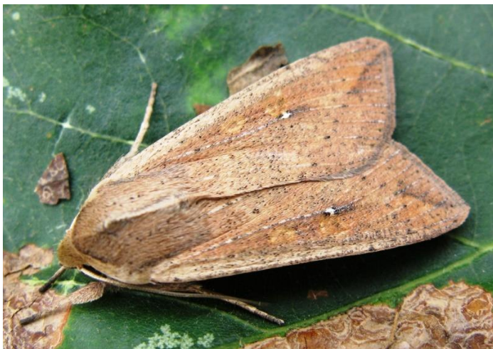
Figure 4. Armyworm moth.

Armyworm moths have pale brown forewings, each with a single small white spot. Make sure to count only armyworm moths, as other moths may also end up in the trap.