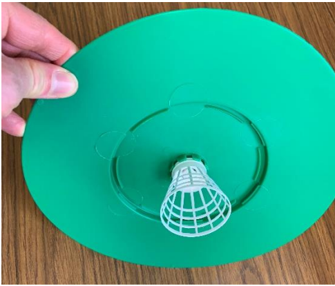
Figure 2. Shuttlecock attached to lid