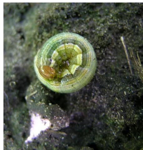
Figure 5. Armyworm larva