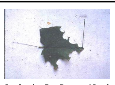
Leafcutting Bee Damaged Leaf (crescent-shaped markings)

The damaged caused by leafcutting bees to ornamental plants can vary from a light defoliation of the plants to a complete stripping of all the leaves and flower petals. The degree of damage to the plant is often influenced by the size of the plant, amount of suitable forage in the area as well as the attractiveness of the plant material for brood cell construction. Most plants belonging to the Rose family ( Rosaceae ) such as roses, raspberries, saskatoons, plums, potentillas, strawberries and apples are highly attractive to leafcutting bees and are considered an excellent source of forage. As an example, native or cultivated rose bushes are often completely stripped of leaves and flower petals when leafcutting bees have identified them as a primary source of cell building material.