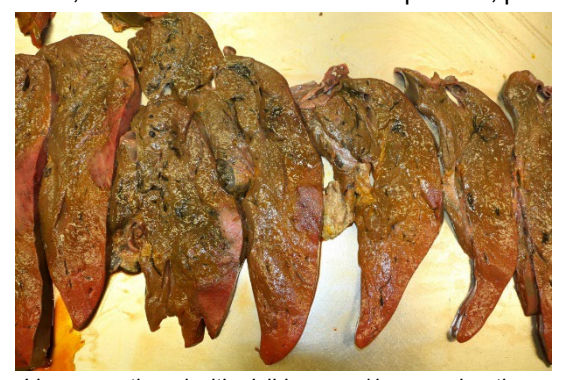
Liver – sectioned with visible green/ brown migration tracts.

Fascioloides magna, distinguished by its large size and absence of an anterior projecting cone, is endemic in the Canadian prairies, predominantly affecting ungulates. This fluke's