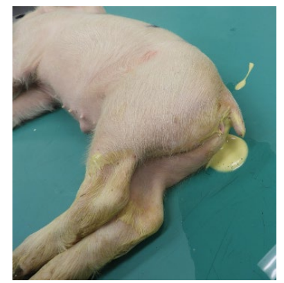
Pasty to semi-liquid diarrhea.

The perineum of all piglets was soiled with white to yellow creamy feces. Similarly, moderate amounts of yellow and watery feces were noted in the small and large intestines. There was a normal amount of milk curd in the stomach. No significant gross findings were found in the rest of the carcasses.