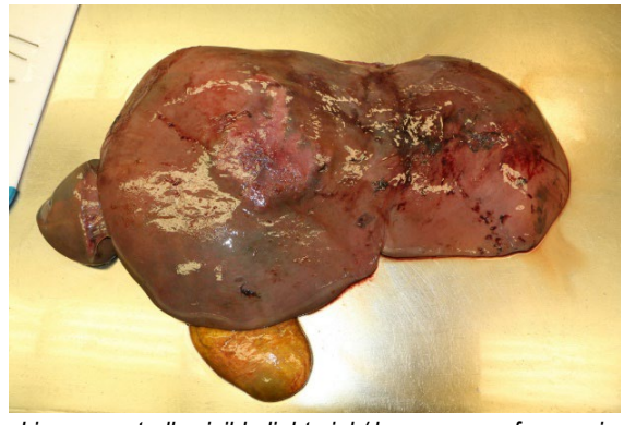
Liver – centrally visible light pink/ brown area of necrosis; multiple green/ brown/ red foci of fluke migration.

Gross diagnoses from the examination included severe trematodiasis resulting in necrotic hepatitis with intralesional flukes, potential migration to the lung, hemorrhagic areas, and parasitic bronchointerstitial pneumonia. Additionally, fibrinous pleuritis and peritonitis were observed, along with possible parasite migration into the ventral abdomen between the peritoneum and skeletal muscle. With the severity of the lesions, there was a