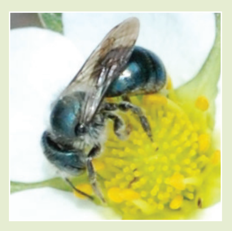
Genus: Osmia; Pictured: Mason Bee